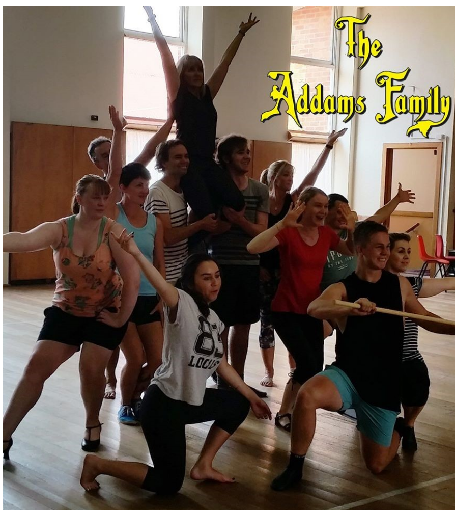
Ensemble & Morticia at rehearsals